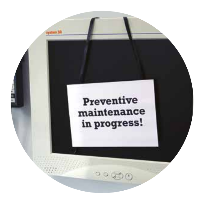
Is your robot several years old?

Unplanned stops of your automatic cells can be very expensive. To reduce the risk of unplanned downtime, we offer preventive maintenance agreements. System 3R's products are built to give extremely long lifetime. To ensure this durability, annual maintenance and inspection are required.