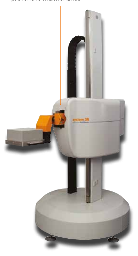
24h x 365 – Availability thanks to preventive maintenance

Function testing and configuration: Cell doors, emergency stops, ID scanning, programmed sequences and back-up. Peripheral equipment: Loading stations, drying stations, draining stations, etc.